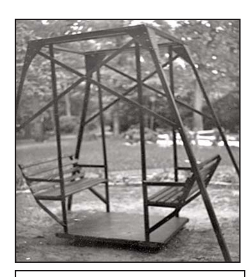
Remember those wonderful swings?

The City of Montgomery purchased the 42-acre Oak Park