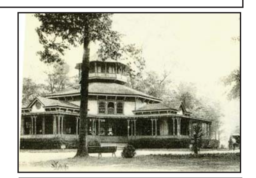
First hexagonal pavilion in early 1900s

property in the late 1880's [in 1893 the purchase was under discussion with many for and against, so it was evidently shortly after June of that year that the purchase was finalized] and the wooded scenic park has served the public for picnics, band concerts, playground for children, and many other recreational activities for all ages.