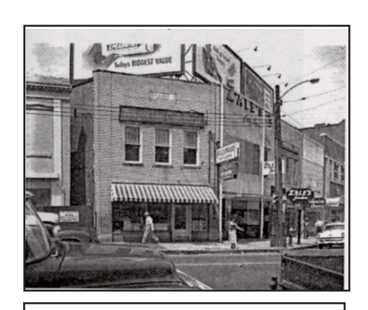
The Tangerine Cafeteria upstairs over Electric Maid Bakery